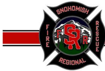
Exhibit A Equipment